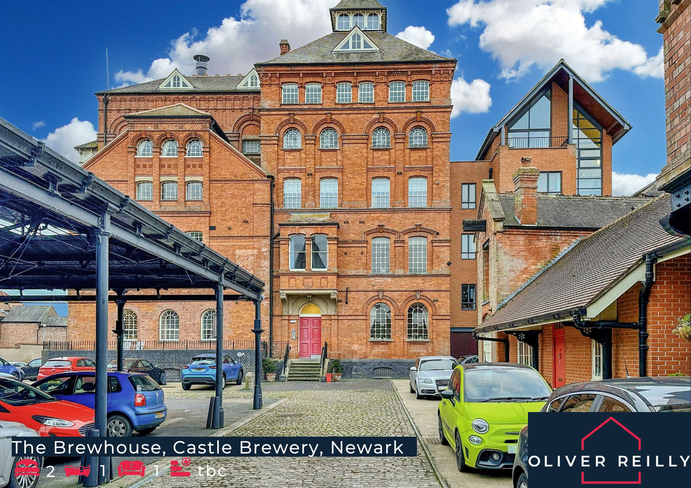
The Brouse, Castle Brewery, Newark